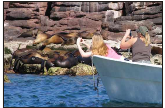
Visiting a California sea lion habitat.