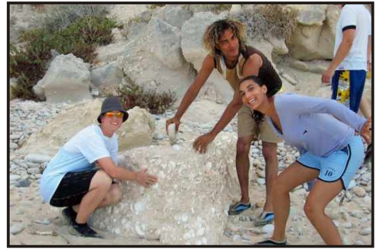
Exploring a fossil seabed.