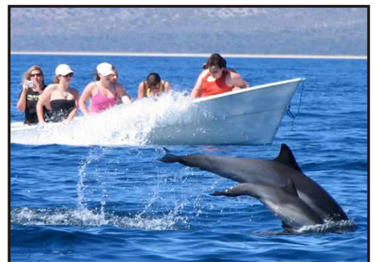
Common Dolphin encounter - mom and calf.