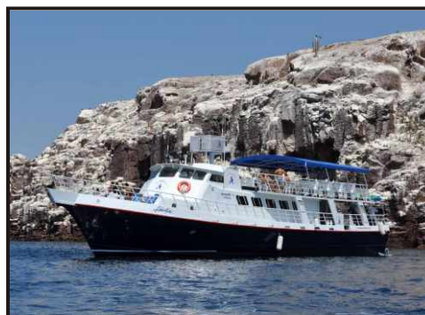
The MV Adventure (110') at anchor.

The "MV Adventure" is a newly built 110' aluminum hull ship. As a certified passenger vessel, all crew, vessel paperwork, safety and navigation equipment meet the legal requirements under the "Nacional de Seguridad Maritima" laws. The multiple level decks are ideal for wildlife viewing and accommodations are private staterooms with single berths, double/quad occupancy. Each stateroom comes complete with air conditioning, cupboards and draws to unpack in, sink/vanity and comfortable spacious bunks. Shared restrooms and showers are separate to the staterooms.