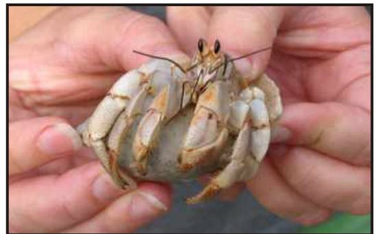
Who's checking who out!

Please feel free to contact us if you have any questions or concerns at info@panterra.com .