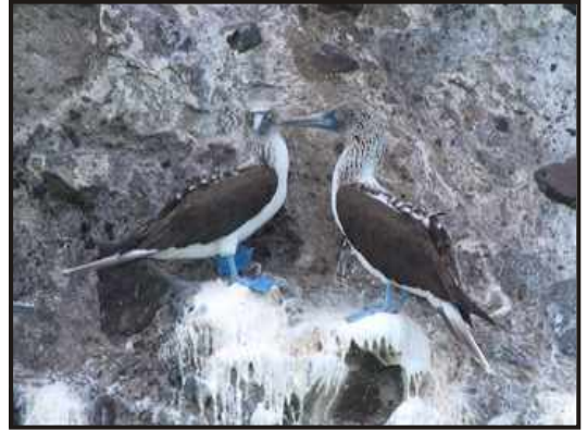
A pair of Blue-footed Boobie birds.

Balance - of $1300.00 is due June 1, 2012.