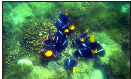
Snorkelling with a school of angelfish.