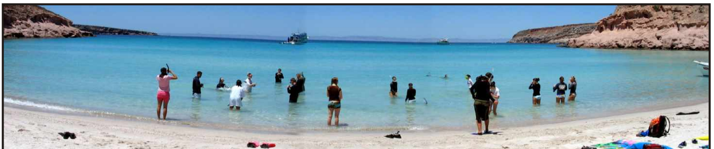
Snorkeling in shallow, crystal clear waters at one of the many beaches visited