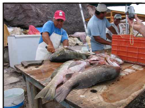
A visit to a fishing village on one of the islands.