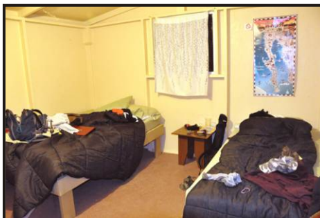
Inside the Konga.