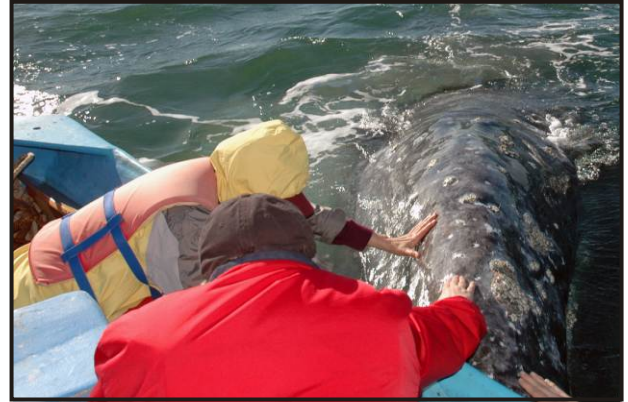
Imagine touching a gray whale!

The ground transportation is by comfortable 14 pax vans and will be arranged by Panterra.