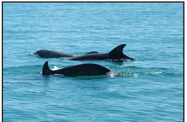
Dolphins can often be found feeding in the lagoon.