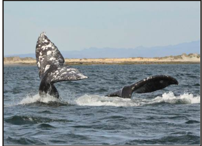
Male and female hanging vertically in the water during a moment of courtship.

San Ignacio Lagoon is world renowned for gray whale interactions with humans. It is the last and only undeveloped nursery and breeding ground in the world of the Pacific Gray Whales.