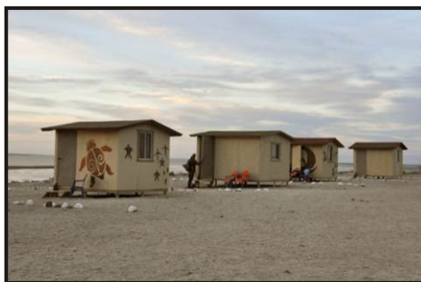
The camp as the sun sets.

Panterra's involvement in the expedition is that of logistics over-seeing the operational aspect of the trip allowing Christine to be free to work with the group.