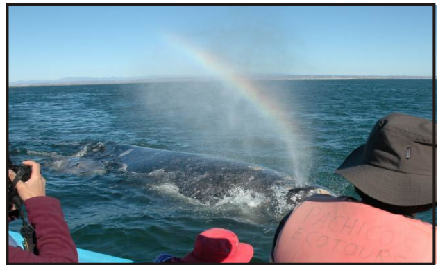
This is what is known as a "whale rainbow".

While our trips are not considered to be strenuous or physically demanding and we do not require a high level of fitness, good general physical condition is necessary. We do not require any previous experience, however it may be beneficial in some situations that may arise. If you have any physical limitations or concerns, please contact us.