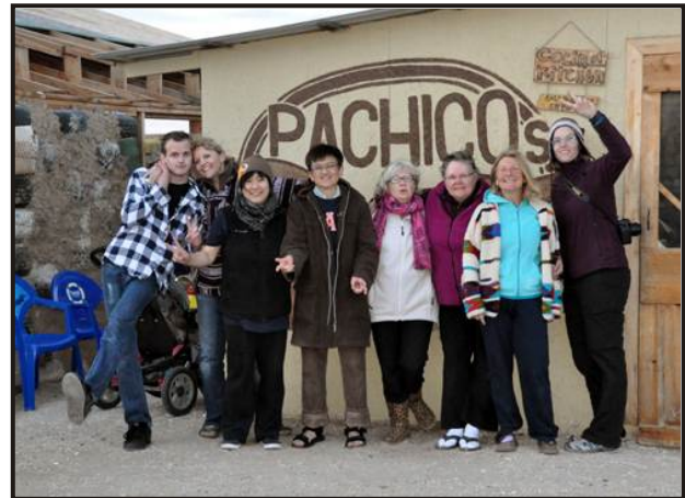
With love from the gang of 2011!

For more information on the expedition please contact: