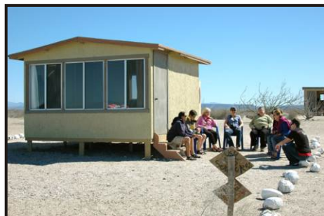
Time spent sharing stories and experience from the days adventure.