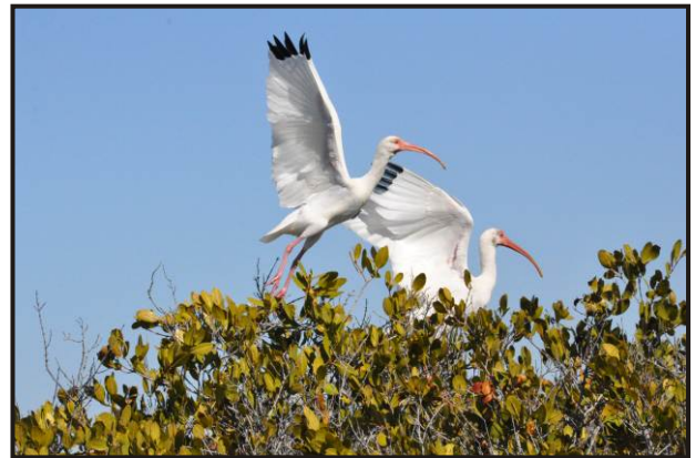
White Ibis in the canopy of the mangrove.