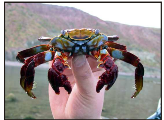
The beautiful Sally Lightfoot crab

On July 15, 2005 the islands of the Sea of Cortez were declared a World Heritage Site. Rich in natural history, unspoiled in beauty, and unrivaled in marine life, the Sea of Cortez is a world of a different time, place and rhythm.