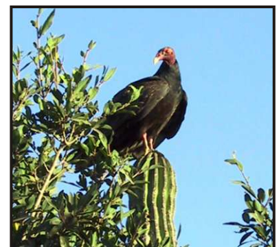
A Turkey Vulture looks on.

Menu - Our meals consist of a variety of healthy and nutritious foods including fresh fruits, vegetables and meats. The ships cuisine reflects the Mexican culture and most dietary needs can be accommodated with advanced notice.