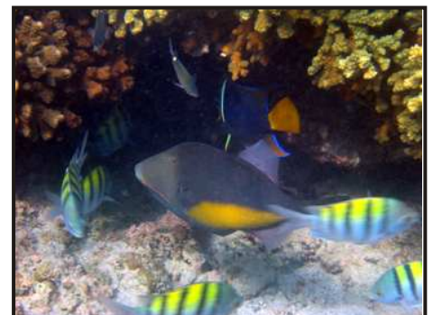
Coral reef dwellers.