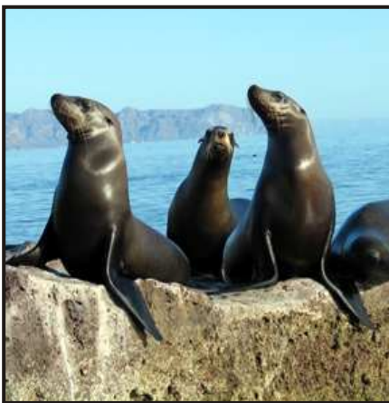
California Sea Lions hanging out

Marine Life Encounters - Marvel at the antics of hundreds of dolphins as they escort us on our journey; swimming along side the ship. Explore a sea lion habitat where males jostle for dominance, females nurture their young and juveniles come out to play. Encounter manta rays as they swim by the ship or do back flips in the distant horizon. Observe the remarkable lives of sea birds. Explore a low tide, where life beneath the sea is exposed for a very short period of the day, revealing some of the most bizarre, yet beautiful marine life. A morning visit to the fishing village of Isla Pardito is an excellent way to experience the simple traditional life of the fishermen of the Baja. The Sea of Cortez is known for its whales and while July is not a strong season it is still possible to encounter them.