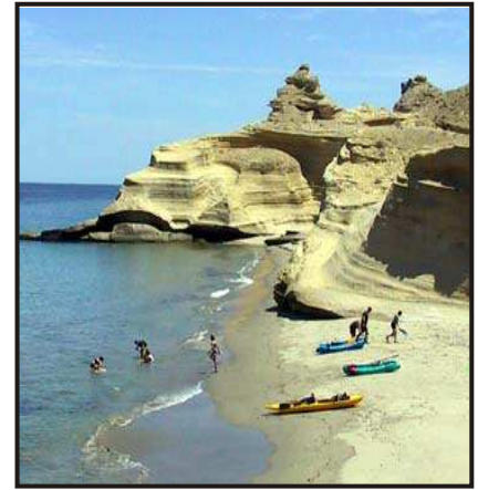
Exploring a fossil beach

Desert Island Nature Hikes - Explore and venture through many different environments. Meander through cactus forests observing native plants and their amazing adaptations to the harsh environment. Take a walk back in time as layers of fossilized rock beds reveal the area's geological past. Visit actively mined salt pans where the local fishermen produce salt to preserve the day's catch. Beachcomb along miles of white sandy beaches identifying bones, shells, and other treasures washed up on the beach. Visit an isolated community of goat herders or fishermen as they allow us to explore their "backyards".