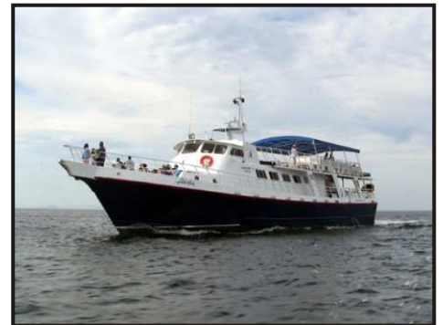
The MV Adventure underway.