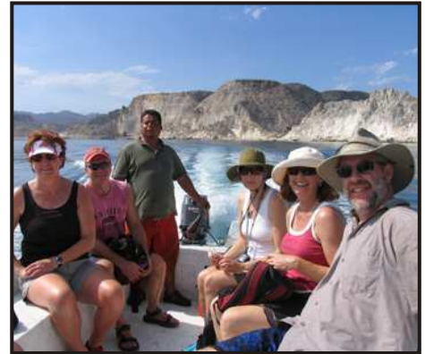
Returning from an early morning hike

Getting to the Ship - The ship, the MV Adventure, is located at Marina Singular, in the city of La Paz. One can fly in and out of La Paz but the costs are far more expensive than flying in and out of Cabo San Lucas. If you fly in and out of Cabo on the expedition dates we can help arrange transport from Cabo to the ship. The cost (one way) is $35.00 US per person and arrival time into Cabo must be no later than 5:00 pm. If you are flying into La Paz the cost for a taxi to the ship is approx. $15.00 US per person.