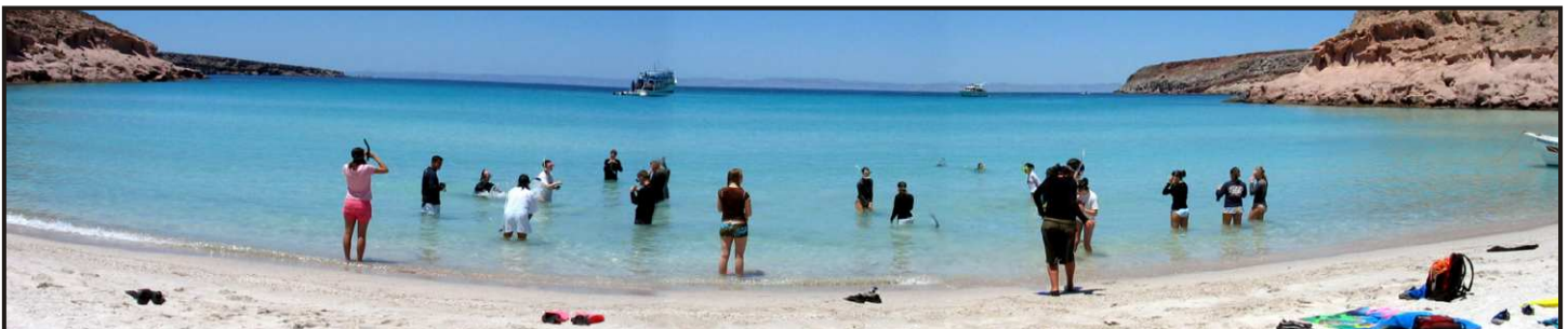
Snorkeling in shallow, crystal clear waters at one of the many beaches visited

Snorkel - in shallow, crystal clear waters and observe the amazing diversity of undersea life. One of the most memorable experiences you will have on this trip is the exhilaration of snorkeling with California sea lions at their volcanic outcrop habitat.