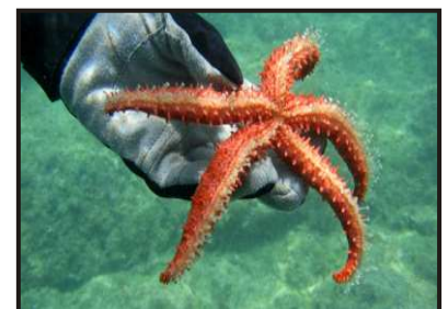
Seastar with tube feet exposed

If you would like more information on the ship, the MV Adventure, please go to our website and click on the heading "Destinations" in the Sea of Cortez section click on "MV Adventure".