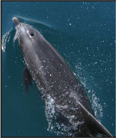
A Bottlenose Dolphin swims alongside the panga as we head to shore.

PANTERRA Educational and Cultural Training Society is a nonprofit, educational organization based in Sidney, BC and Calgary, AB. With over 20 years of experience, our goals are to impart a knowledge and awareness of the earth's natural history, demonstrate environmental conservation through educational endeavors, and inspire an interest in further learning.