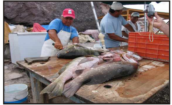
A visit to a local fishing village on one of the islands.