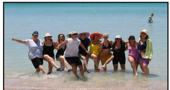
Laughter is the best medicine.