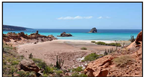
The untouched, raw beauty of the islands.