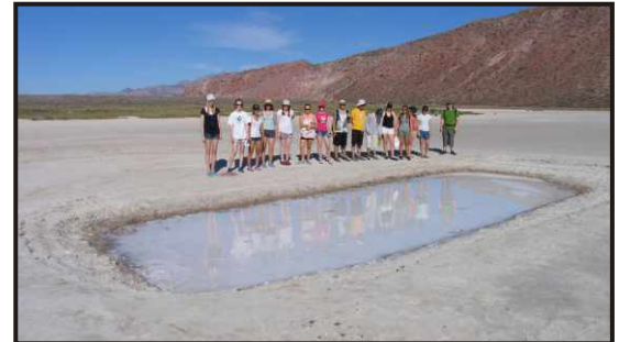
Mined salt pans used by the local fishermen.