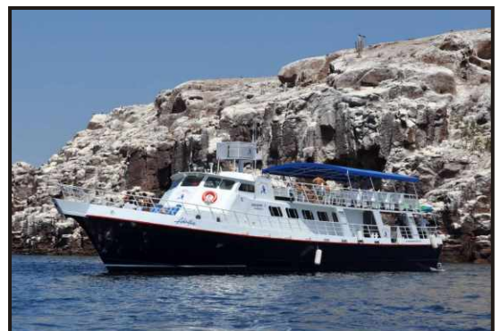
The MV Adventure (110') at anchor.