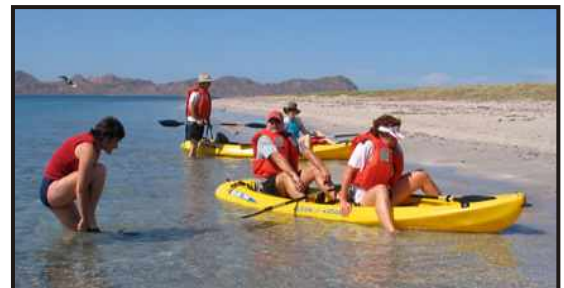
Late afternoon snorkel and kayak.