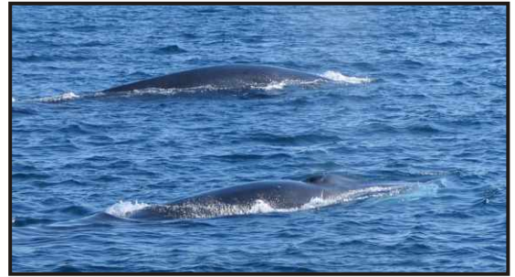
Blue whales feeding in the area.

The ship's naturalists bring to the expedition an educational component with 30 years of combined experience in teaching marine sciences, natural history and astronomy in the Baja. Our goal is to blend adventure travel with environmental and conscious awareness, providing participants with an unforgettable cultural and educational experience. The Captain, engineer and crew are onboard to insure the safety and well being of the group. They bring many years of mariner experience in the Sea of Cortez and exemplify the warmth and kindness that reflects the beauty and hospitality of the people of Baja, Mexico.