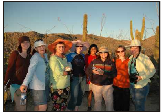
A late afternoon hike ends as the sun sets.