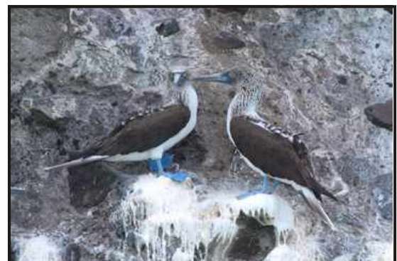
Amazing bird life - Blue-footed Boobie birds.