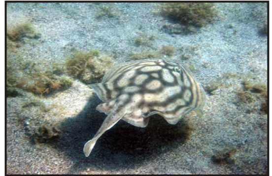
Bulls-eye Stingray watches as we swim by.