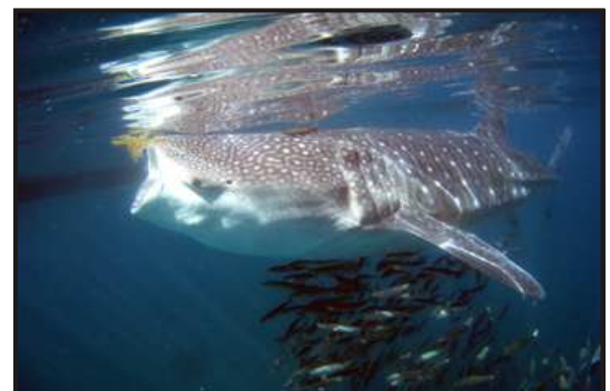
Whale Shark feeding.