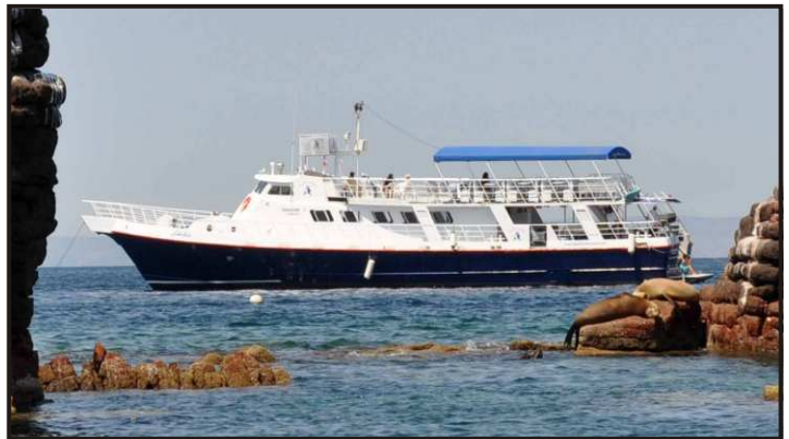
The MV Adventure anchored at the sea lion colony of Los Isolotes.