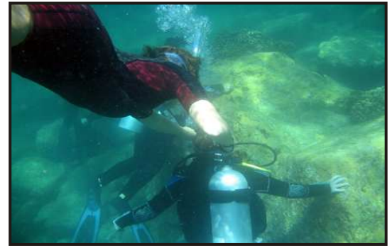
The Sea of Cortez ia an aquarium chalked full of amazing marine life. There is lots to see and explore.

All amenities onboard the ship (i.e. meals, accommodations, trip equipment inclusive of air, weights and tanks, and ships library), tourism fees, pre-immigration clearance, 2 nights accommodations at the Marina Hotel in La Paz and airport transfers on trip day of arrival/departure from La Paz or Cabo airports.