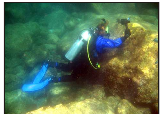
The Sea of Cortez offers world class diving in the largest natural aquarium on earth.