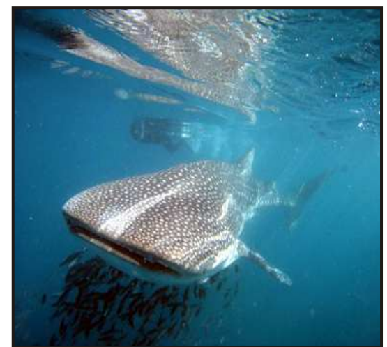
Deni at work.