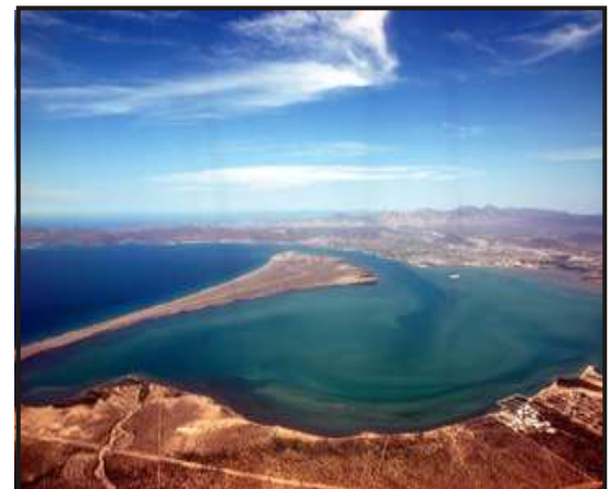
Aerial view of El Mogote and the Bay of La Paz. Sanctuary for juvenile whale sharks.