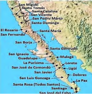
Misiones of Baja California