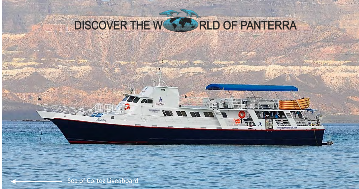
← Sea of Cortez Liveaboard